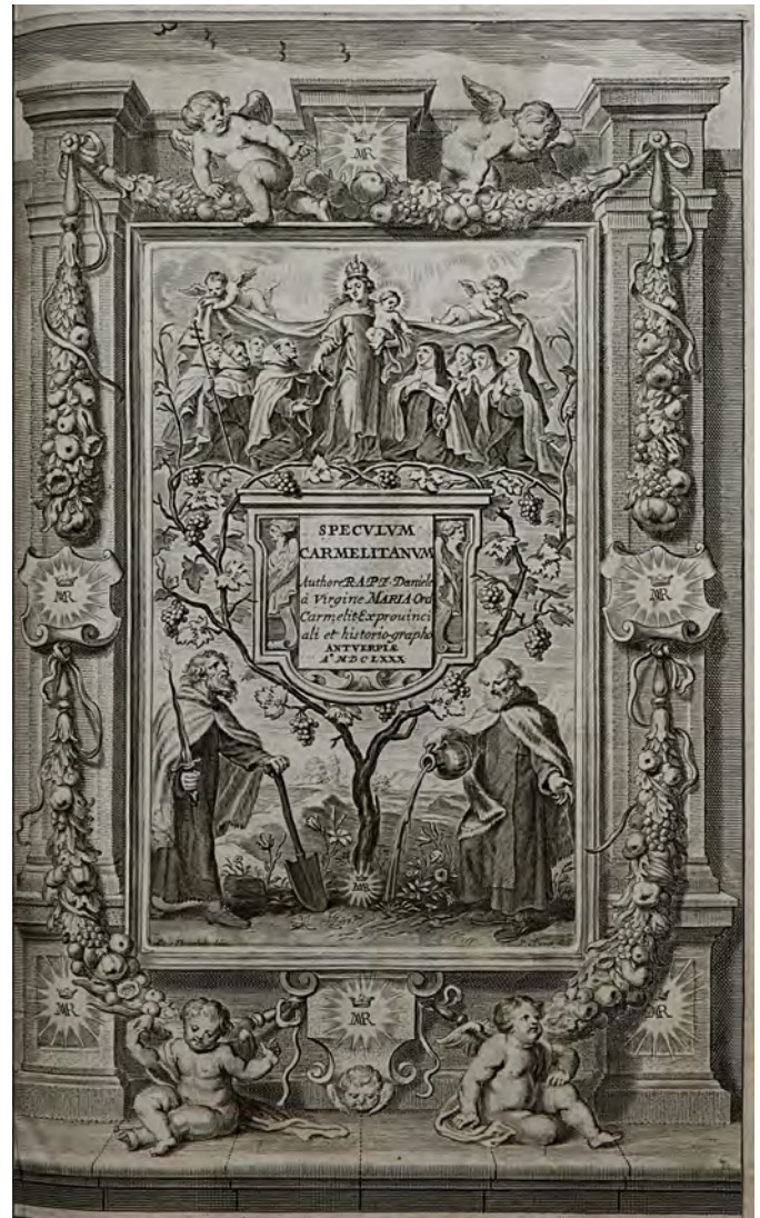
Featured engraving in Speculum Carmelitanum

A library staff member, Huw Sandaver, has also created a 3D model of the volume's binding.